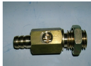
Part Number: SSWP-BH1N-70