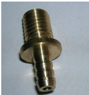
Part No: SCNV-BR2T-59A