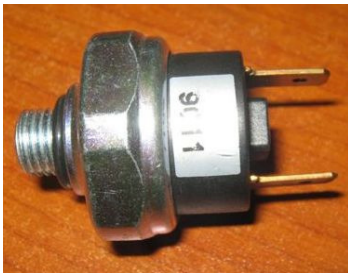
Part Number: SWP-W3K